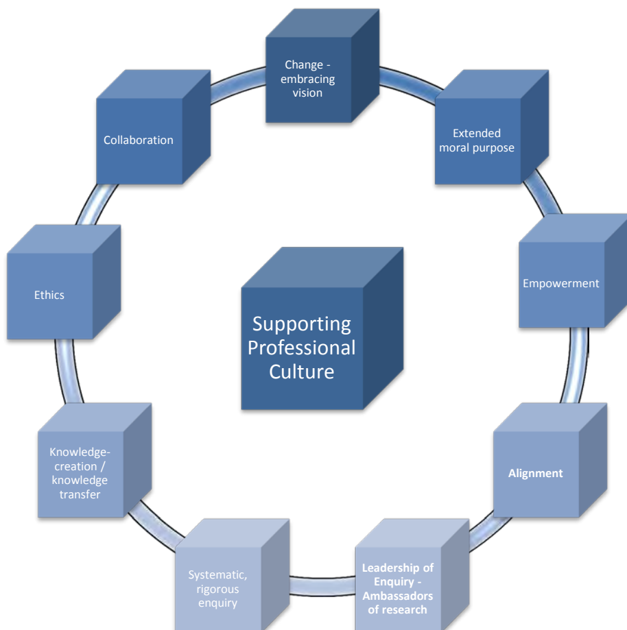
Figure 1: Supporting a professional culture within the alliance

This helped to establish a research culture, supporting leaders and teachers in understanding the principles of research-engagement and connecting research with everyday practice, rather than viewing it as an 'add on.' Importantly, time was spent considering the values and principles underpinning the work towards a research culture as reflected in figure 1.