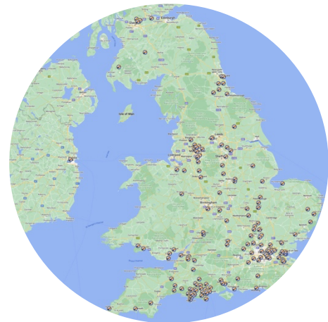
Data: 28 th February 2023

All participants of the research project receive free support and training to implement the programme, plus planning tools, digital resources and live impact reporting dashboards.